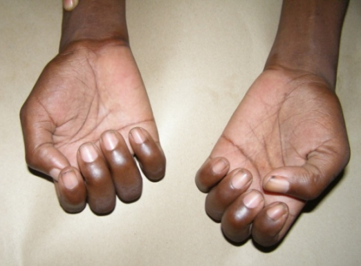
Clawing of hands