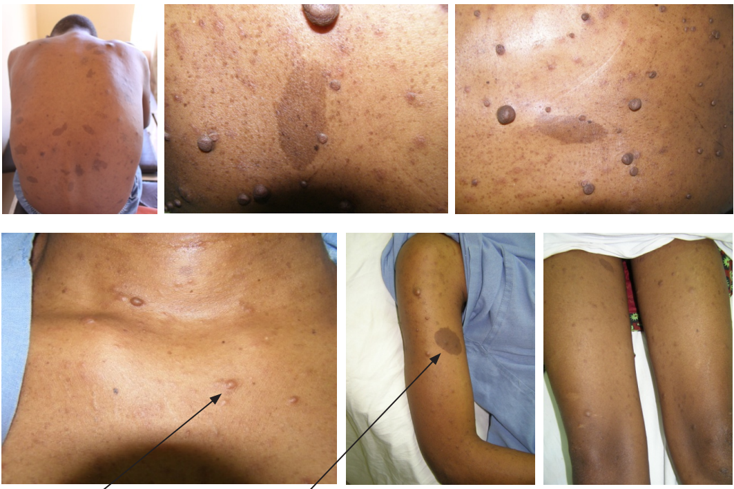
Multiple neurofibromata & cafe au lait spots