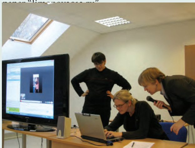
Multimodal communication @ F3.5 SPb