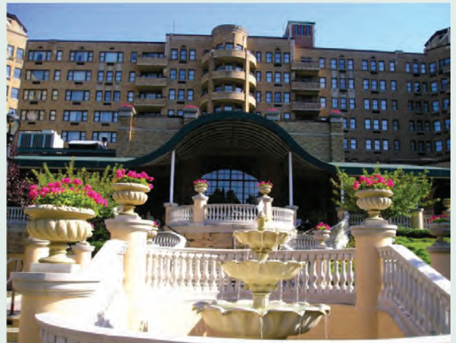
ASEEES 2011. Omni Shoreham Hotel.

The Future of Russian team itself also actively participated, with both a project-related panel and a number of individual papers. Alternative