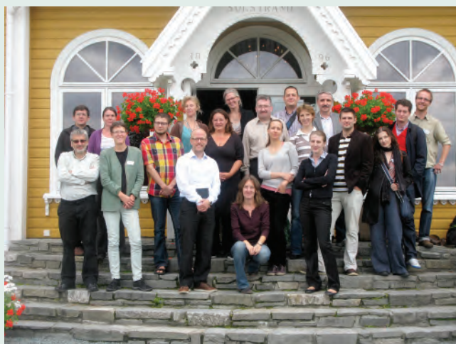
Old Conflicts—New Media @ Solstrand, Norway