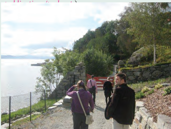
Afternoon walk to Oseana @ WebWars conference, Solstrand, Norway