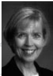
Anne-Grete Strøm-Erichsen Chief Commissioner

Work hard and play well during your stay in Bergen!