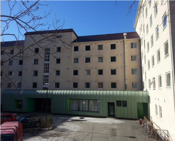
Alrek student hostel, Årstadveien no. 25.

Alrek student hostel is situated on the medical campus not far from the city centre.