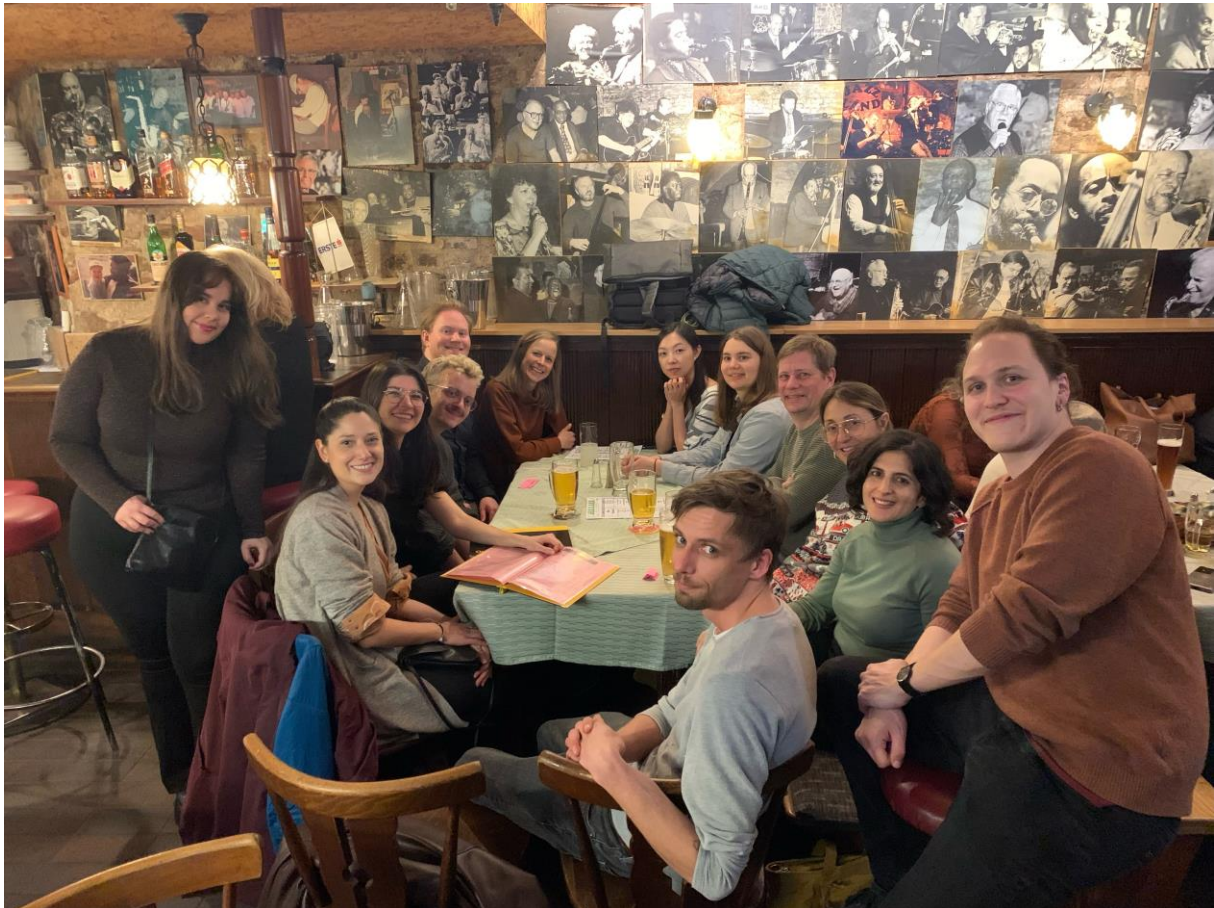
Music4Autism project at Jazzland 2023