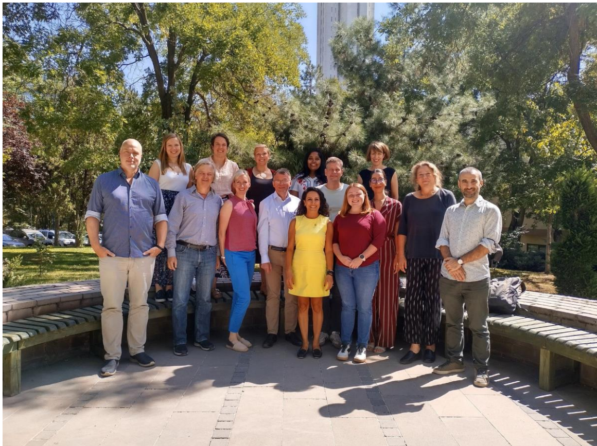
Middel- project meeting in Turkey, Fall 2022.