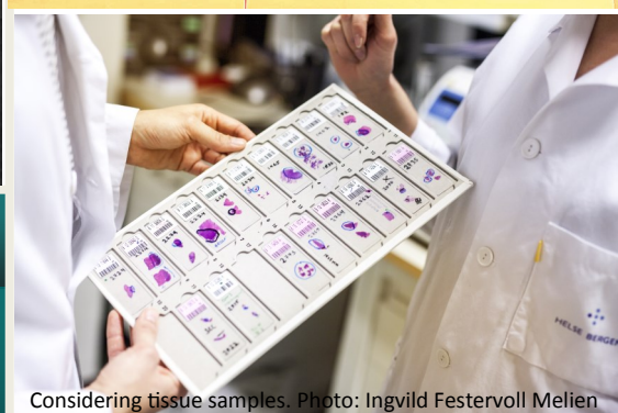
Considering tissue samples.