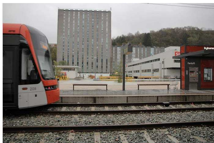
Bybane stop in front of Fantoft student hostel