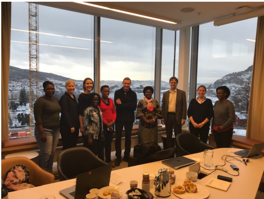
Participants Mental Health Day, UiB 1