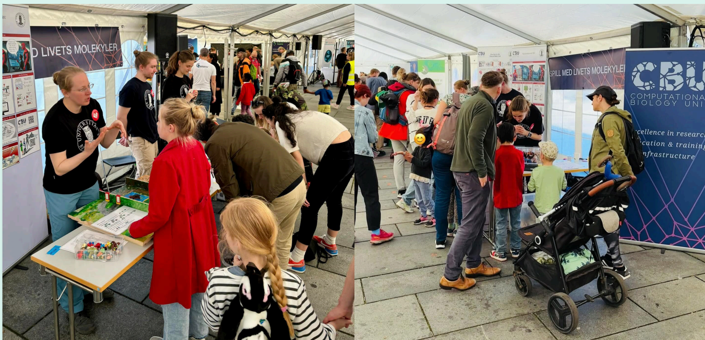
Photos from CBU's booth at Forskningstorget 2024

Please register here: Department of Informatics Gathering 2025 by March 20. The program is in the making and will be announced soon. It will consist of one session regarding education, one session regarding research where our plan A is the EVALMIT rapport which we are waiting for these days, and the annual HSE-seminar – this year focusing on the results from the ARK survey. Please join in for a nice time at the wonderful Solstrand together with your awesome colleagues!