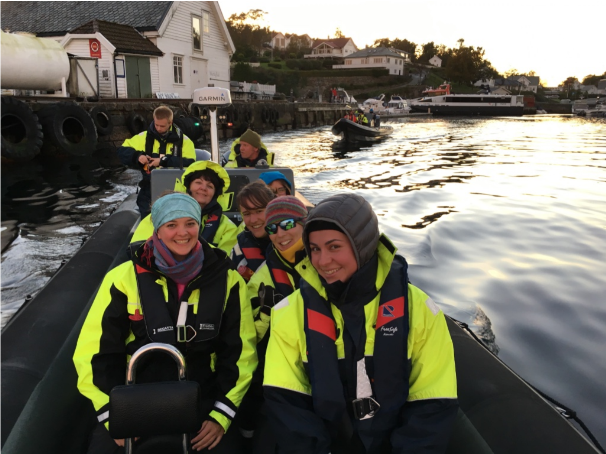
Field trip