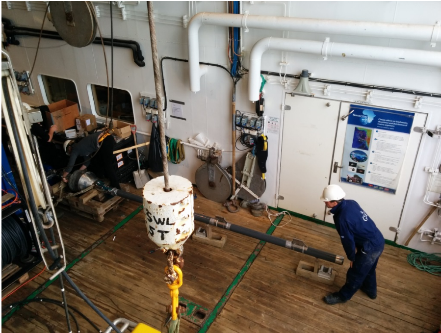
SLJ examining a recovered sediment core