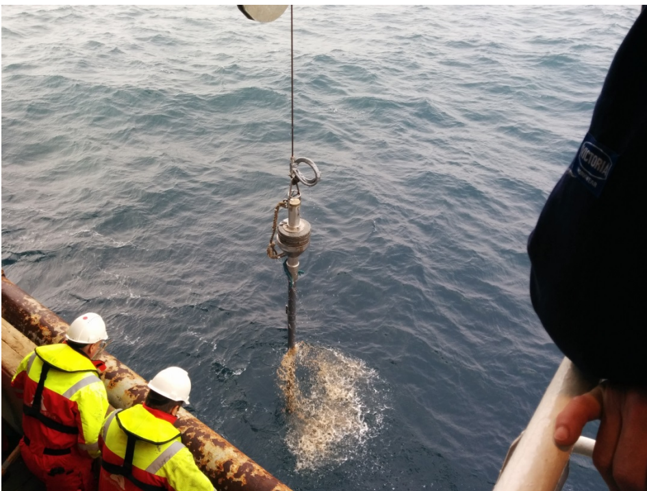
Launching a gravity corer to retrieve ocean floor sediments