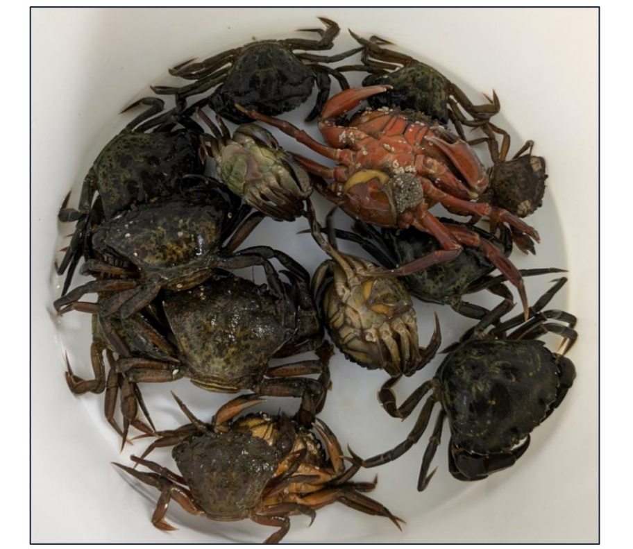
Crabs infected with parasite

As a marine ecologist, I specialized in small plankton organisms and crustaceans. My main areas of interest are parasites' effects on aquaculture and marine life, as well as the ways that climate change is affecting ecosystems, species, and human society. I am keen to discover new knowledge that will inspire industry and aquaculture to use marine resources more sustainably and to identify cutting-edge ideas and environmentally friendly technology solutions that can benefit society and the environment. By joining the SEAS programme, I can pursue my scientific interests while simultaneously putting research findings into practice to make a positive environmental impact in industry and influence maritime area management.