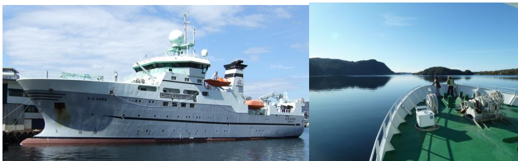
Left: the research ship G.O. Sars; right: a sunny October day on the field course in Masfjorden.