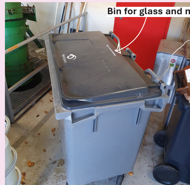
Bin for glass and metal waste