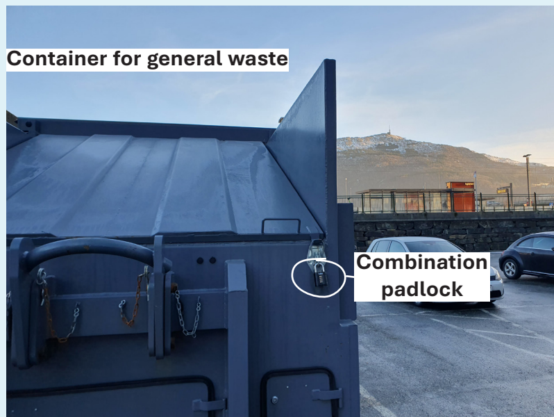
Container for general waste