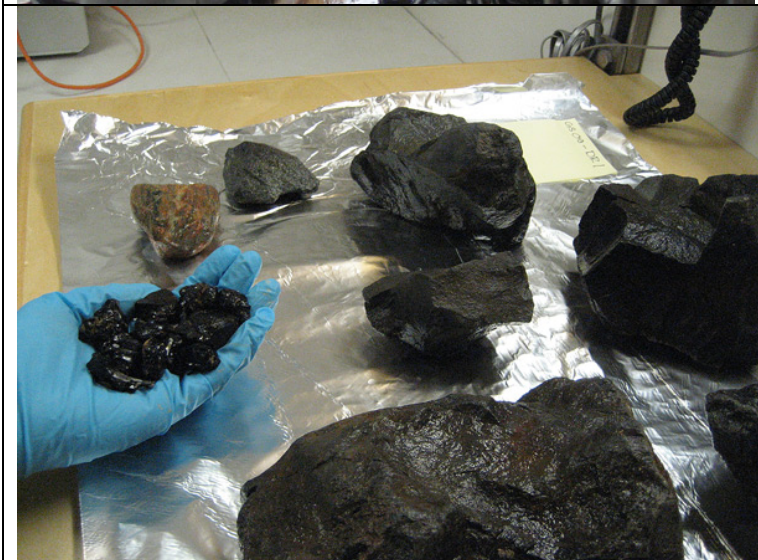
The rock collection washed up!

Notice how glassy the samples look. They actually are glass – lava – complete with edges sharp enough to cut.