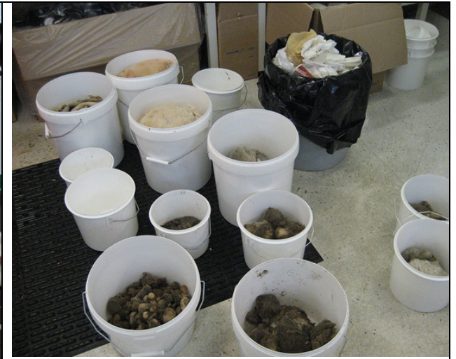
After sorting – more than 30 specimen containers were labelled and packed up to take back on land.