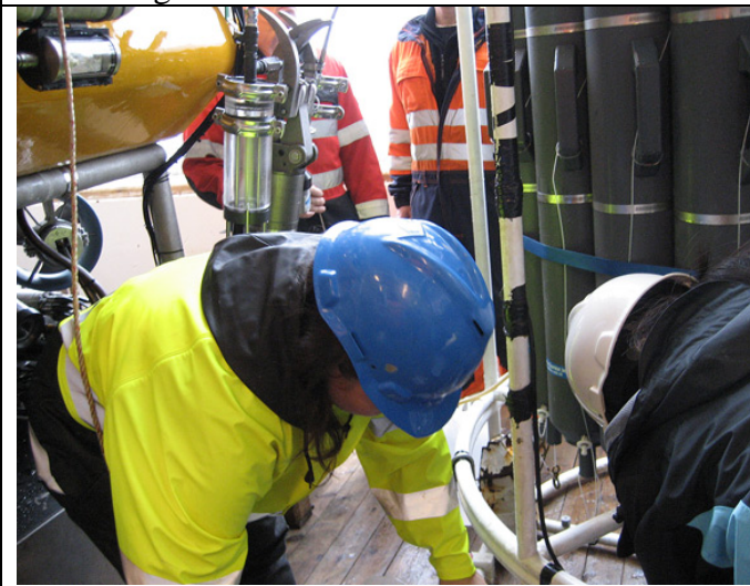
The large CTD was used to take water samples