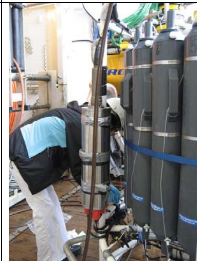
Shanshan is extracting water for geochemical