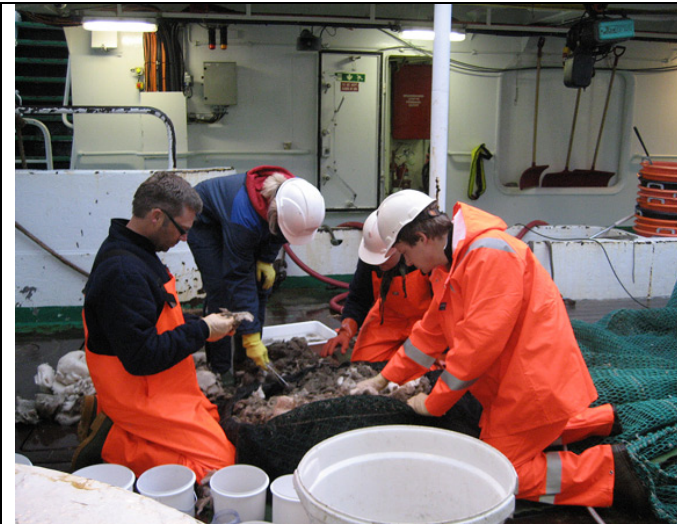
The macro-biology team had night duty. Here they are sorting a huge haul of sponges (and a few other things)!